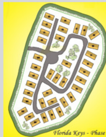
Florida Keys - Phase 3

Please call 0800 048 9940 to arrange an appointment!